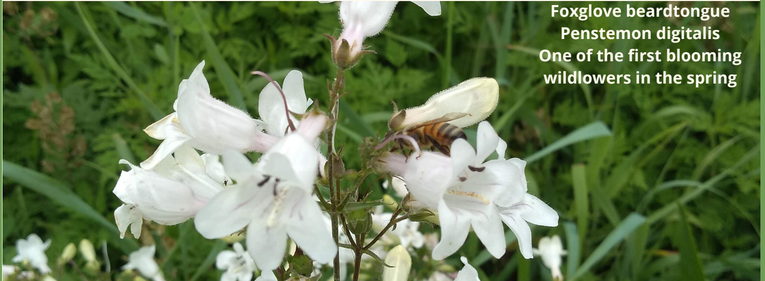
Foxglove beardtongue Penstemon digitalis One of the first blooming wildflowers in the spring

VOLUNTEER NEWS, OPPORTUNITIES, AND APPRECIATION