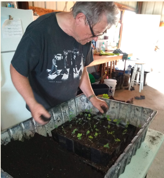
Will transplants seedlings into larger pots, so they can grow bigger before planting at the marsh